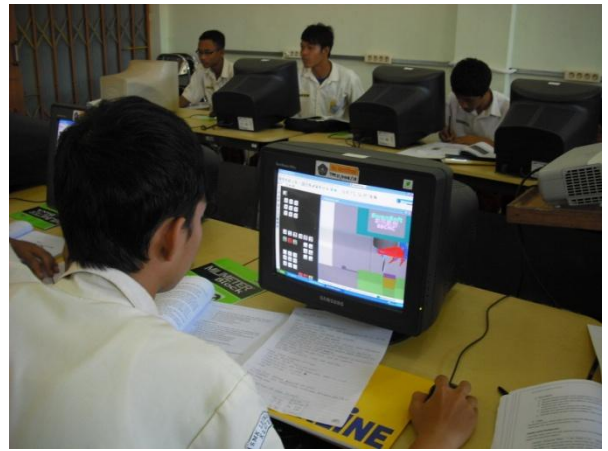
Figure 4. Vocational High School students learn CNC with virtual CNC machine References

advantages: saves costs, save time training, safety, and can be accessed anytime.