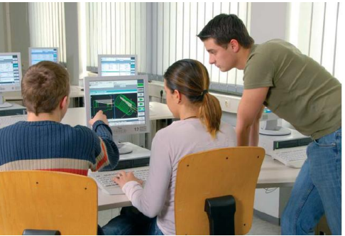
Figure 1. SinuTrain Training Emco Industrial training

With the option "Virtual machine designed for training purposes", SinuTrain offers – through a 3D simulation of the machining process – realityidentical system operation increasing the efficiency of CNC training (Figure 1). This option allows to "manufacture" workpieces on the PC using realityidentical processes, on the basis of three implemented machine types – including one milling machine and two turning machines, one of these equipped with a counterspindle. The advantage of it is the customer need not buy expensive machines. When the machine purchase costs are too high on account of reduced budgets, the "Virtual machine designed for training purposes" is a low-cost alternative to CNC training.