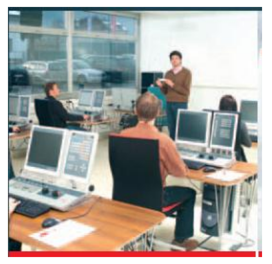
Figure 2. EMCO CNC Training

or slid. The software includes interactive 3-Dobjects and users can move, enlarge and shrink graphics using the mouse and the animations can be manipulated.