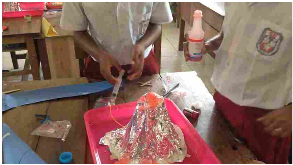
Figure 4: A group of students demonstrated the model of volcanic eruption

Attitude preparedness of volcanoes eruptions are also trained in the activities of this serial figure games.