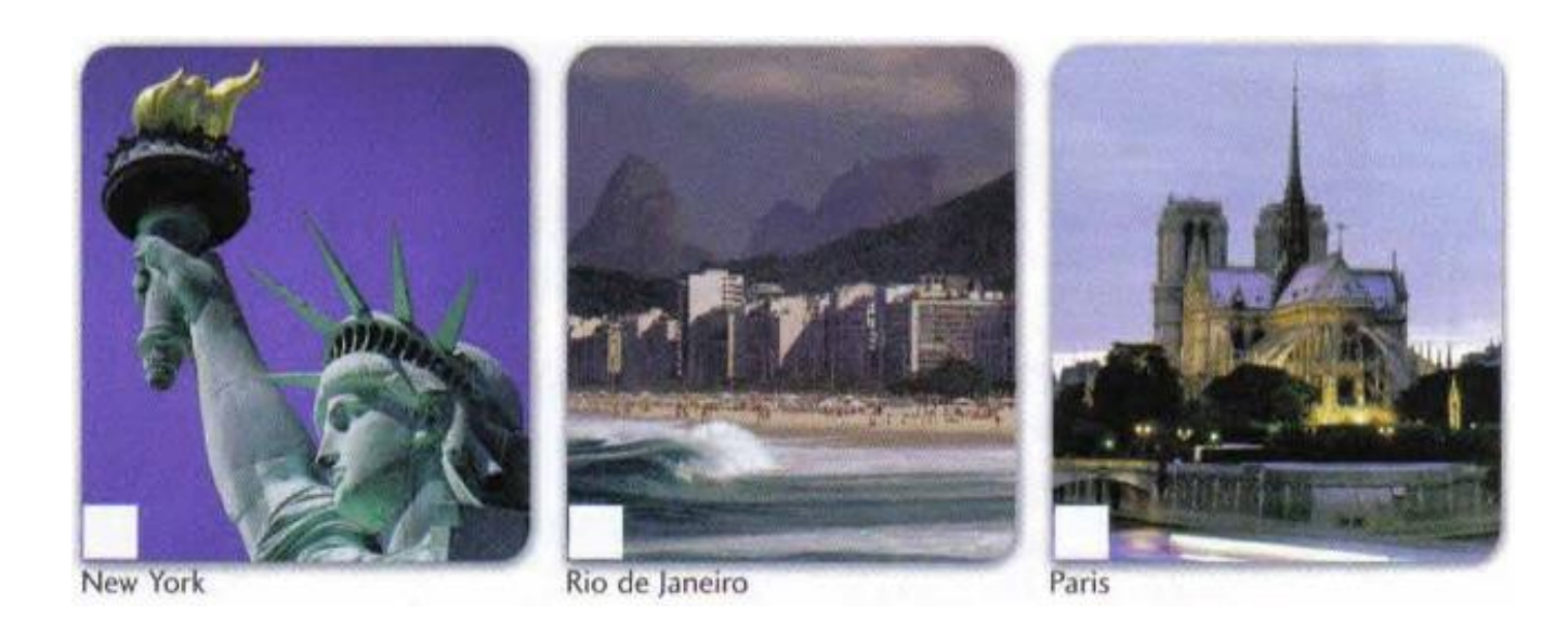
Task 2. Listen again. What can you do in each city.

F. Task 1. Listen to people talking about their cities. Where do they live? Number the picture.