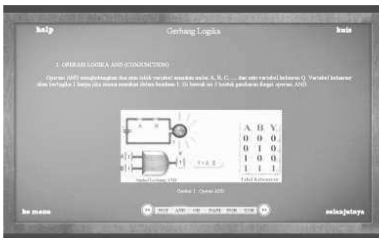
Figure 3. The user interface of computer-based learning media

At this cycle, students are asked to use the learning media at the school. Prior to the development of media, teachers need a lot of time to deliver the material. At this cycle, teachers just give a little bit of introduction, and then students are asked to learn on their own with the media. After that the students are asked to do the lab works and complete the related tasks. The evaluation process is done by observing student's lab works results.